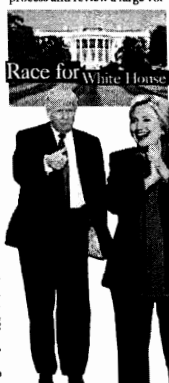
Race for White House

the Congress on October 28 in which Comey had said the FBI has reopened the investigation following discovery of some pertinent emails on the laptop of former Congressman Anthony Weiner, the estranged husband of Clinton's close aide Huma Abedin. "Since my letter (of October 28), the FBI investigation team has been working around the clock to process and review a large vol-